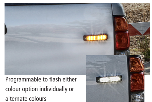
Programmable to flash either colour option individually or alternate colours